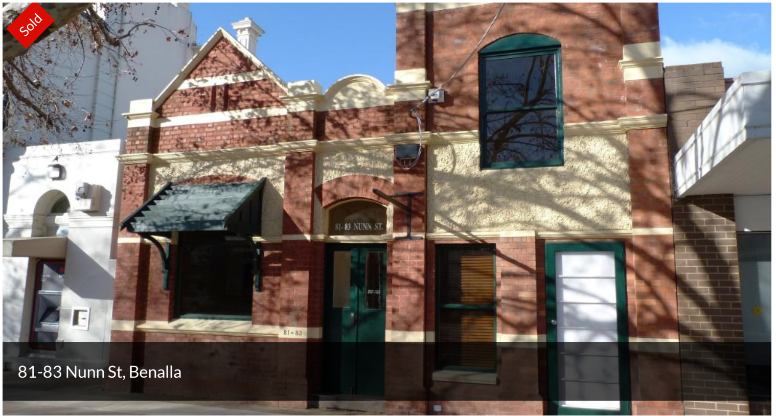
81-83 Nunn St, Benalla