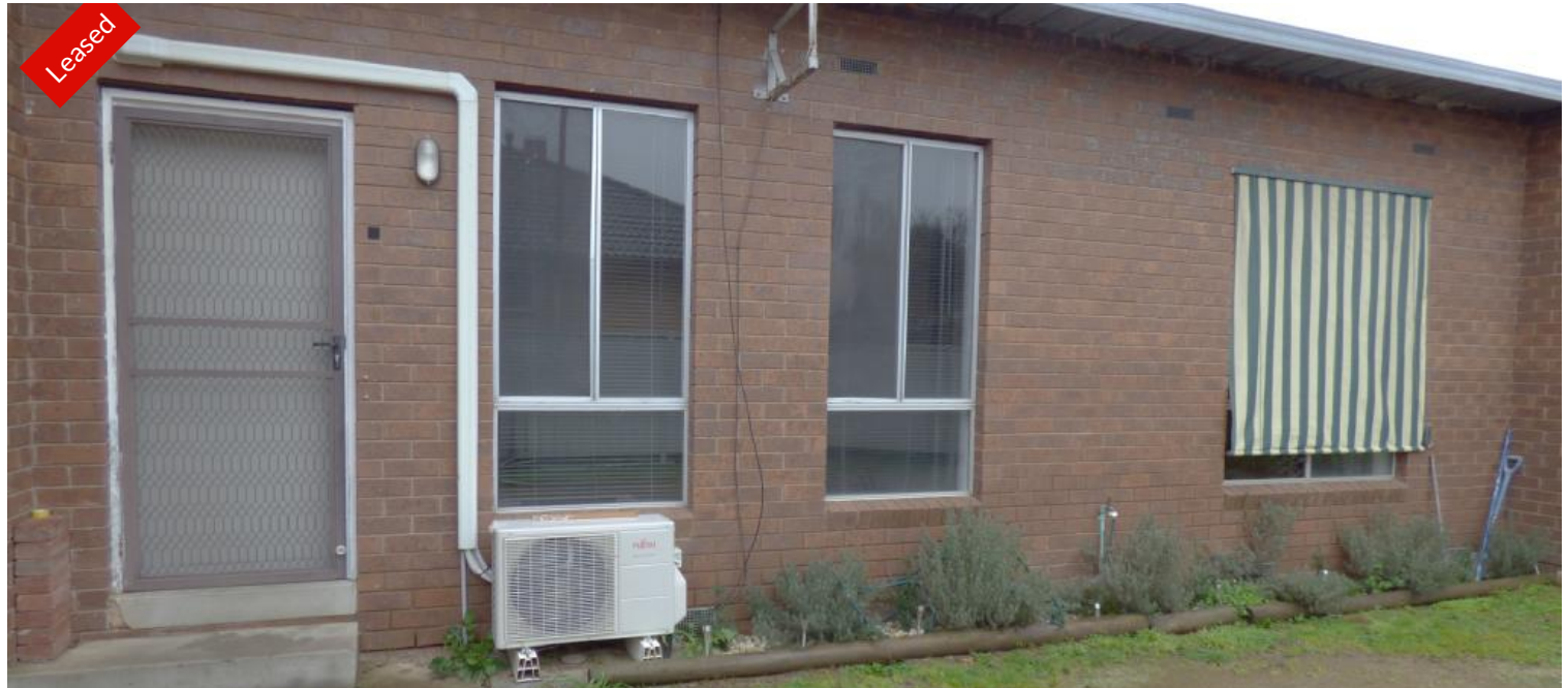
Unit 2, 22 Monds Ave, Benalla