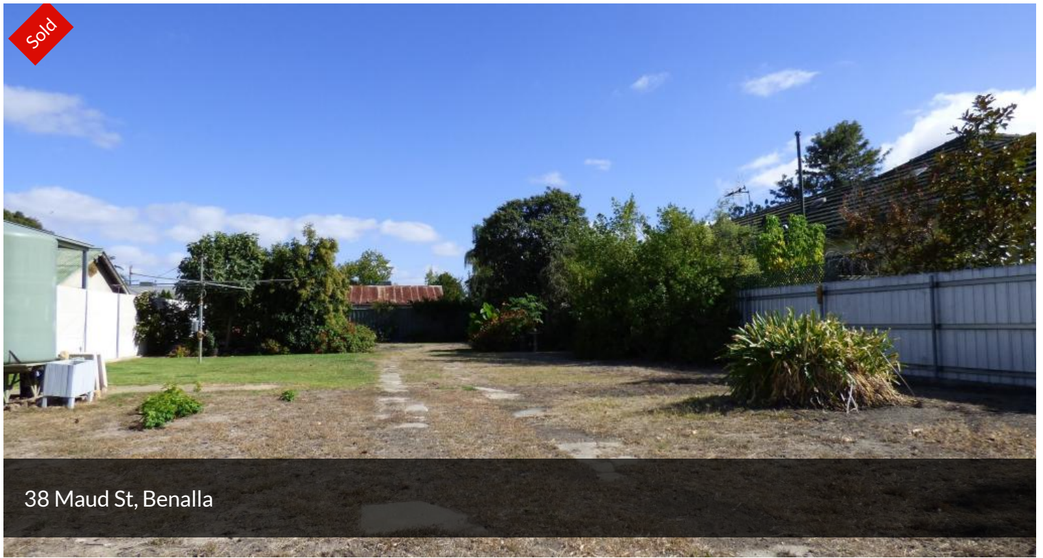
38 Maud St, Benalla