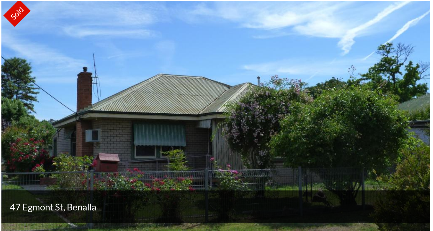
47 Egmont St, Benalla