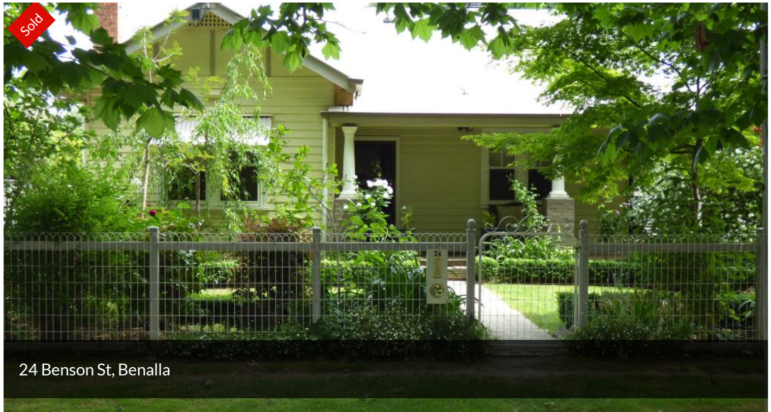
24 Benson St, Benalla