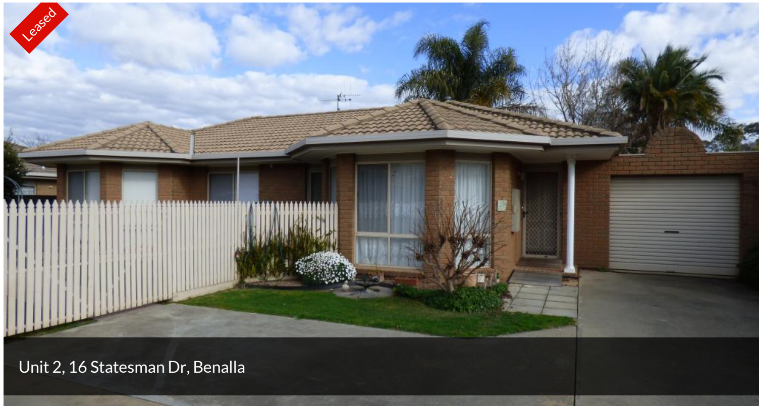
Unit 2, 16 Statesman Dr, Benalla