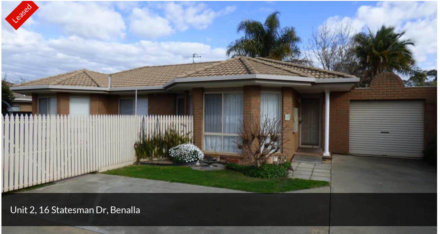
Unit 2, 16 Statesman Dr, Benalla