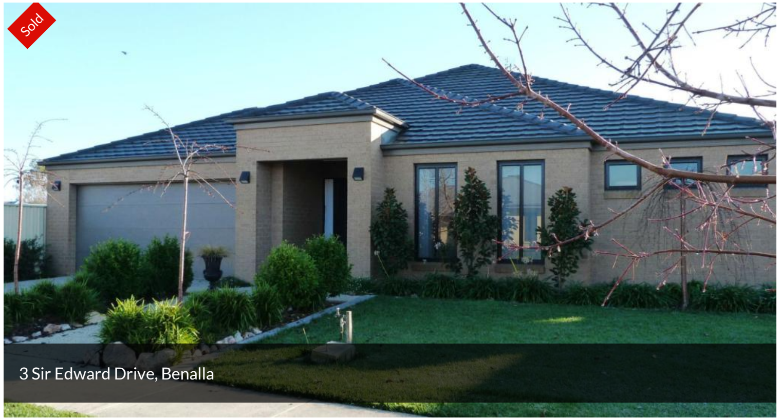
3 Sir Edward Drive, Benalla