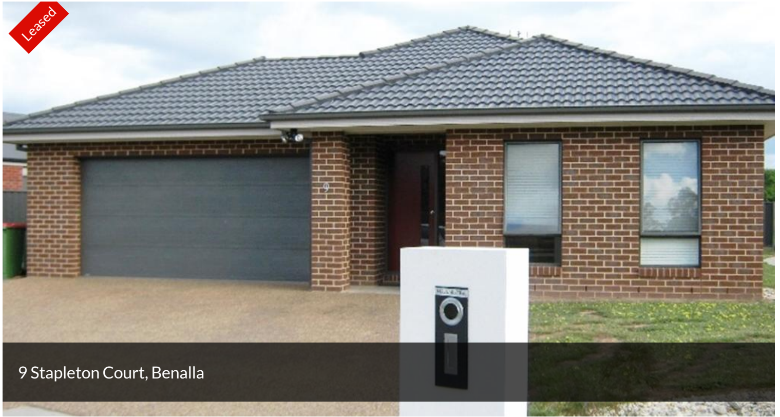
9 Stapleton Court, Benalla