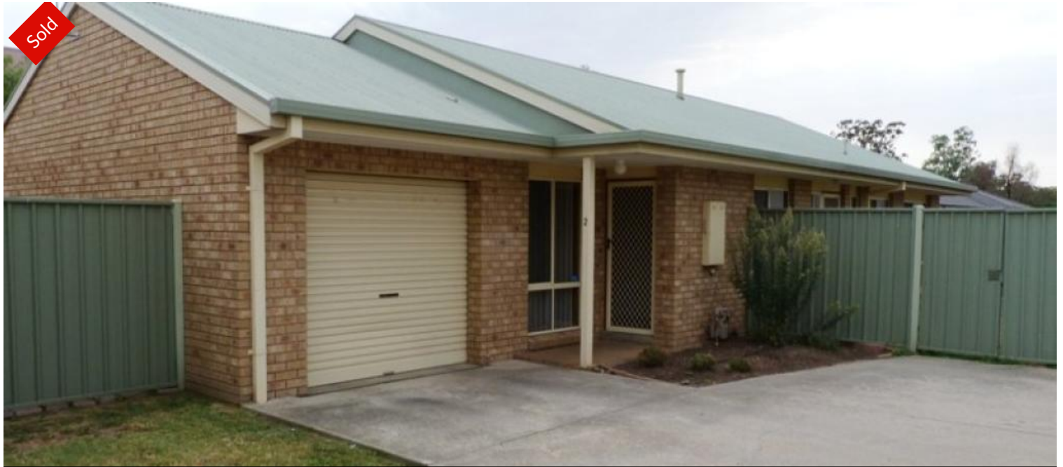
Unit 2, 5 Goodenia Drive, Benalla