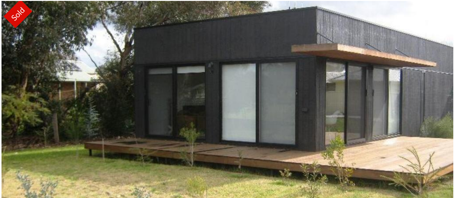
Unit Unit 2, 20 Wattletree Grove, Benalla