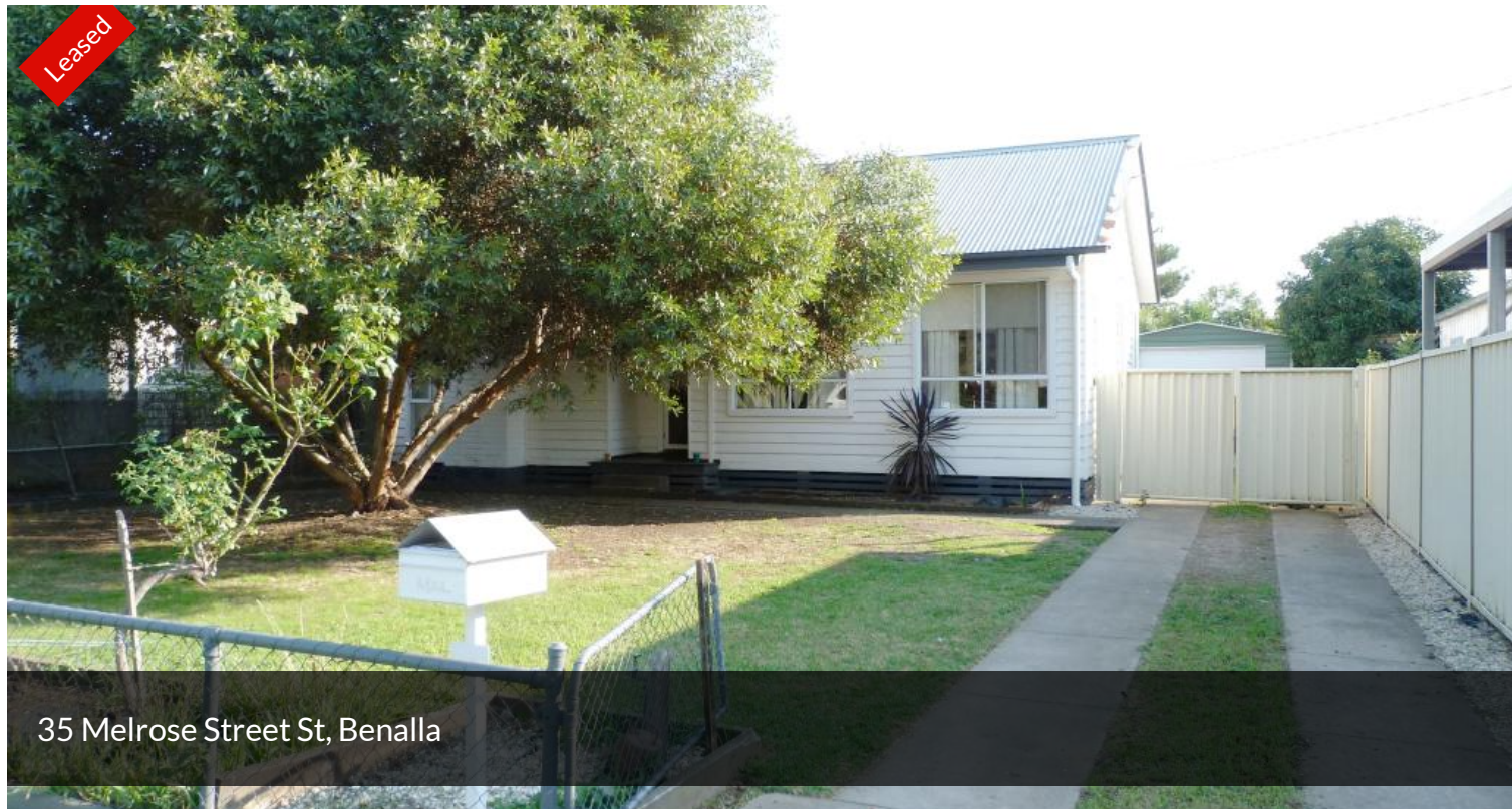
35 Melrose Street St, Benalla