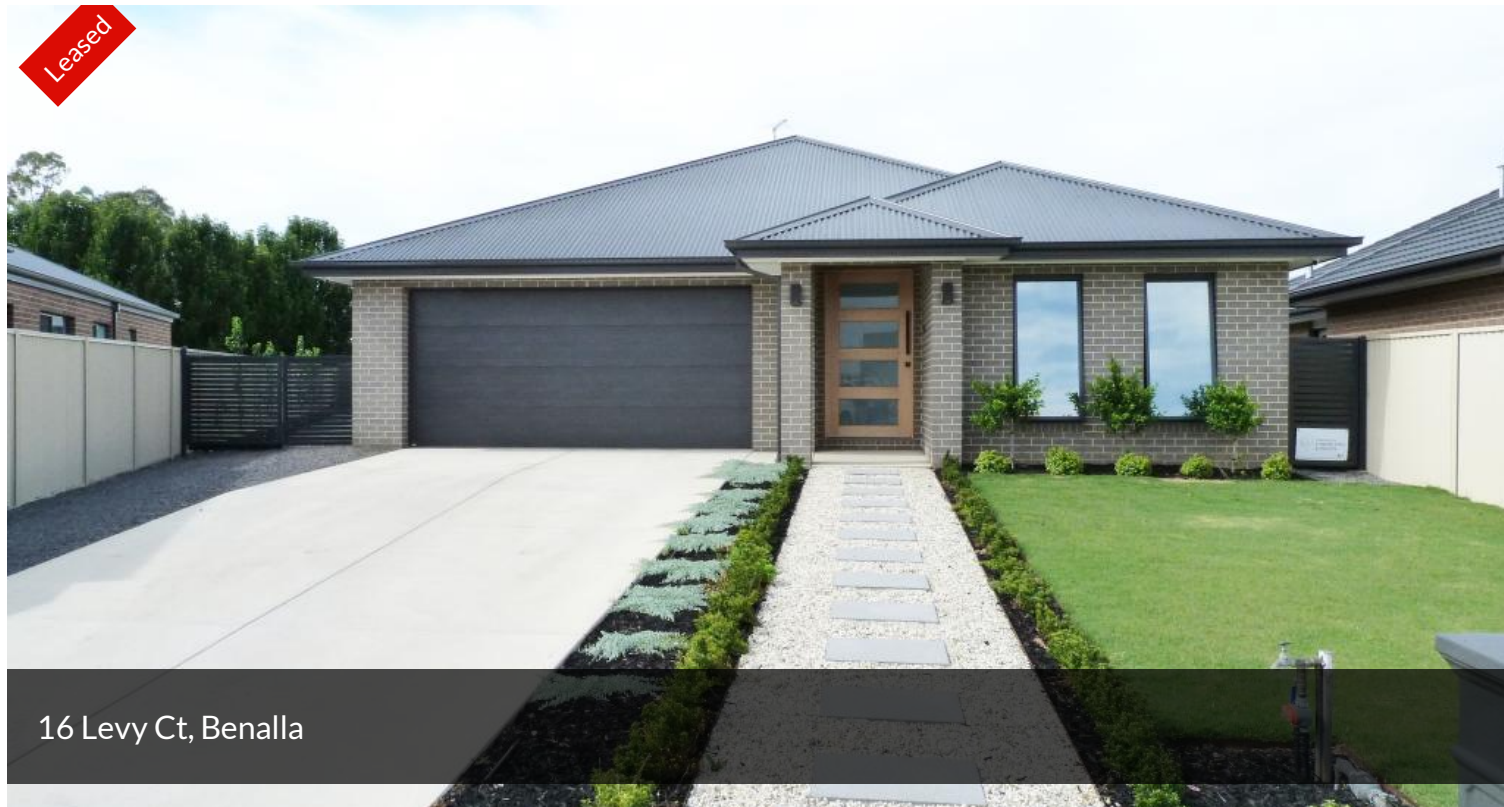
16 Levy Ct, Benalla