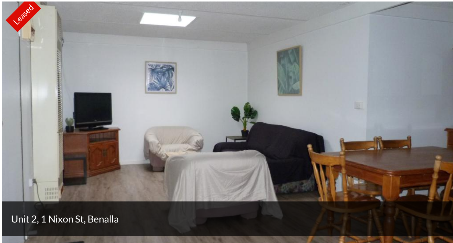
Unit 2, 1 Nixon St, Benalla