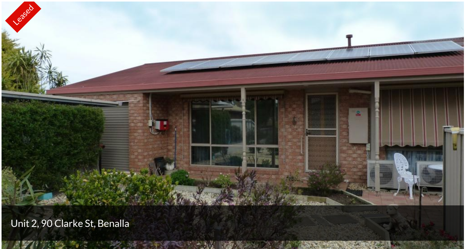
Unit 2, 90 Clarke St, Benalla