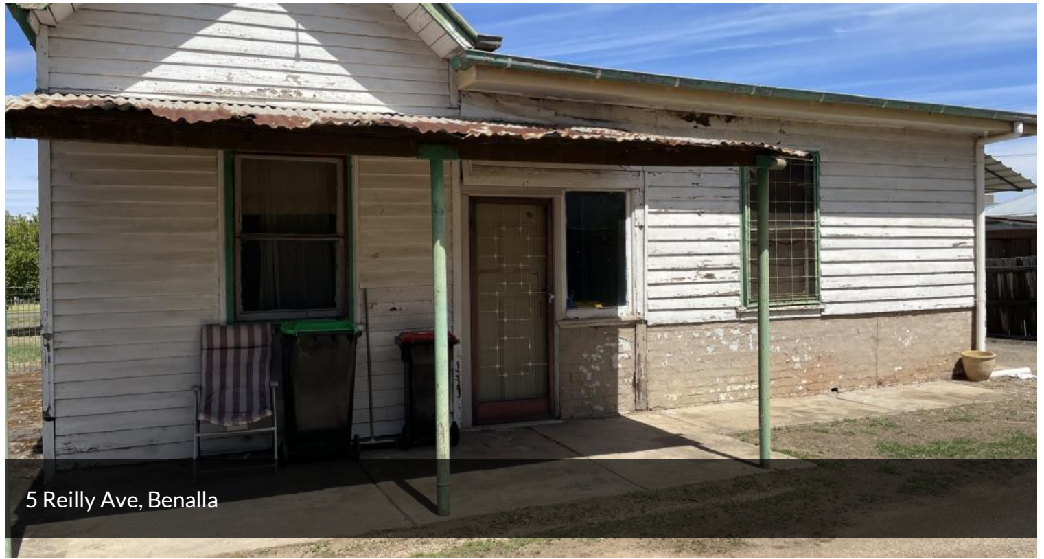
5 Reilly Ave, Benalla