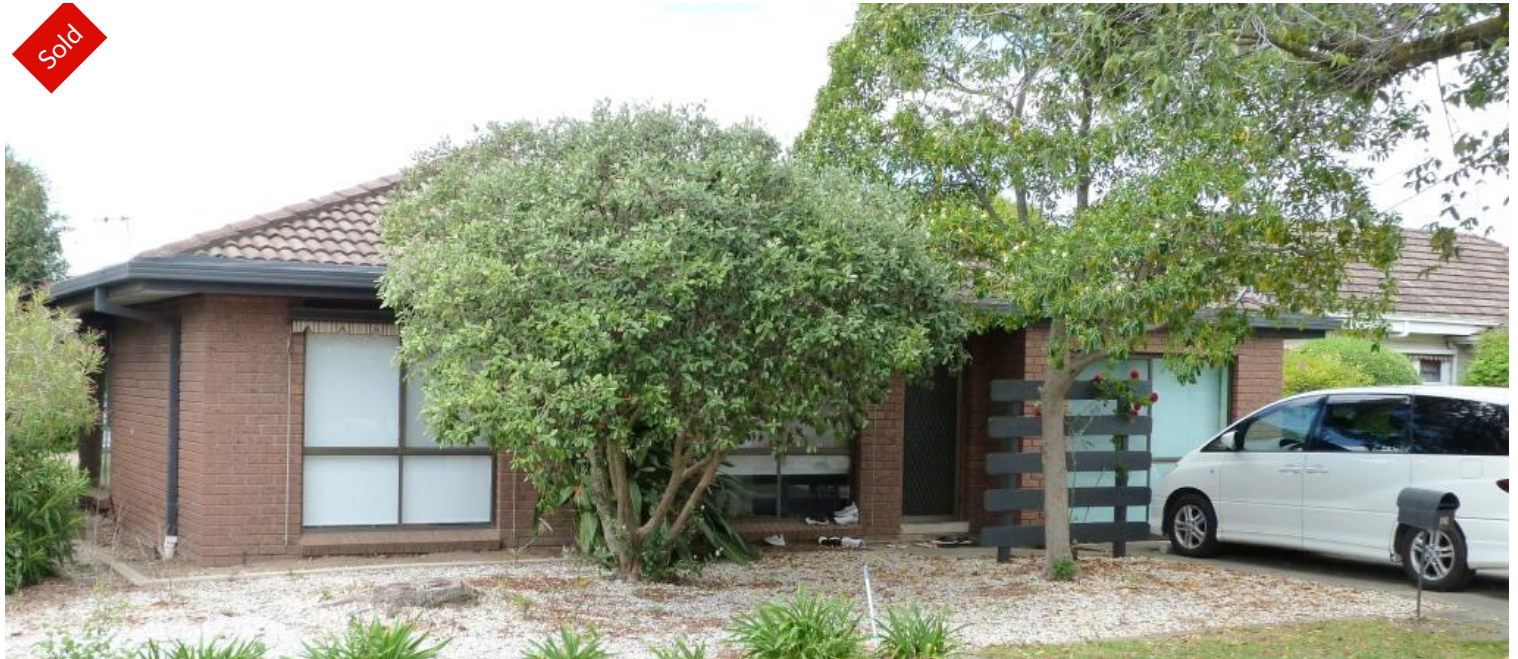
1, 21 Smythe Street, Benalla