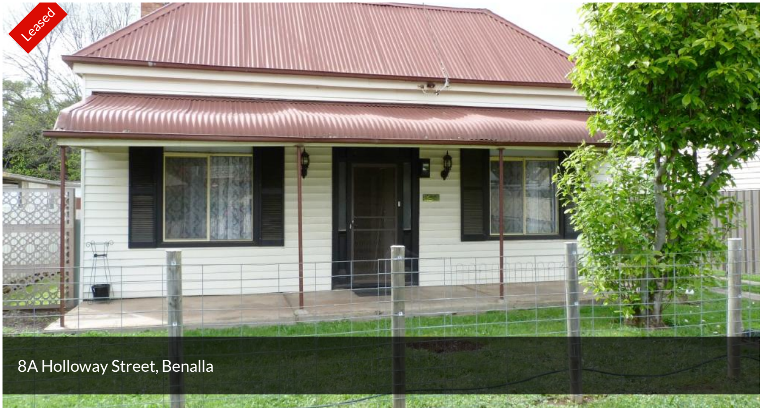
8A Holloway Street, Benalla