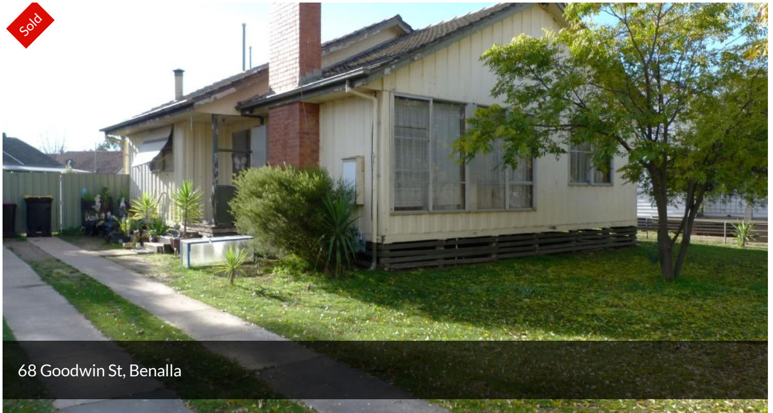
68 Goodwin St, Benalla