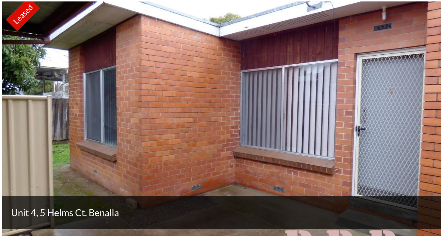
Unit 4, 5 Helms Ct, Benalla