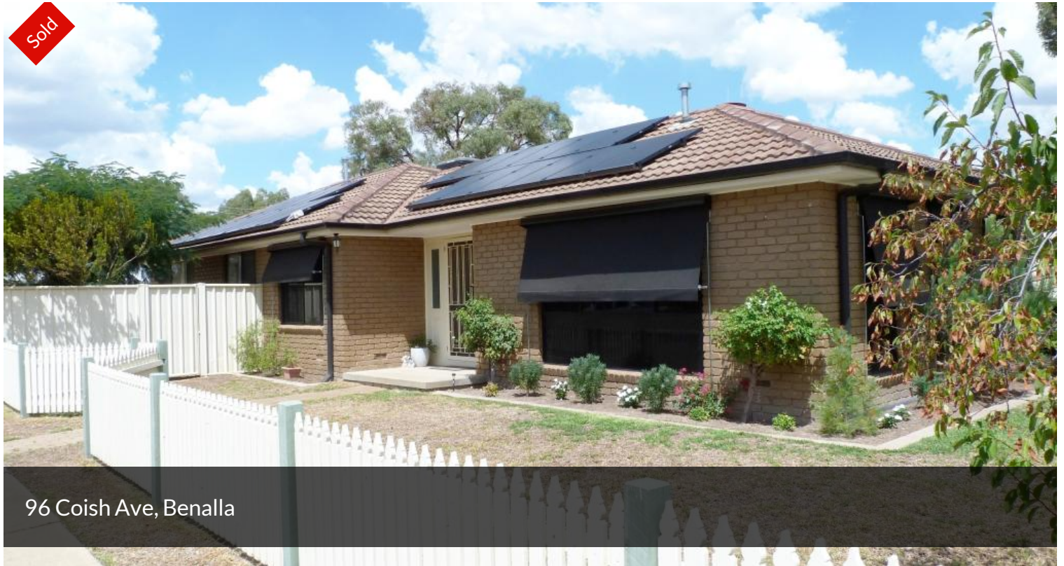
96 Coish Ave, Benalla