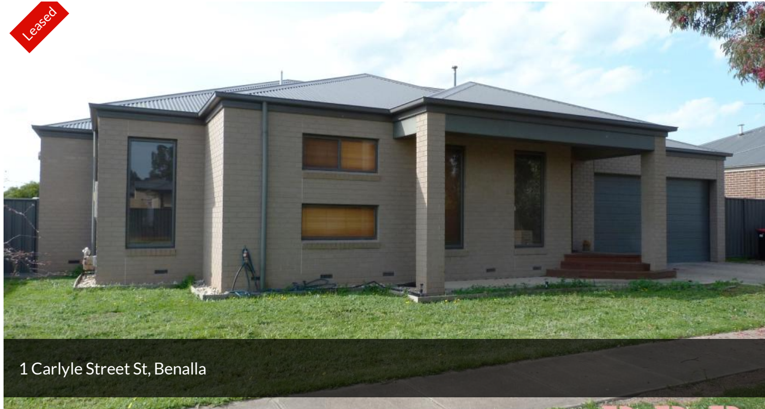
1 Carlyle Street St, Benalla